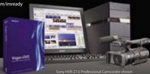
Sony HVR-Z1U Professional Camcorder shown with optional ECM-678 shotgun microphone

For a free demo or to learn more: www.sony.com/imready