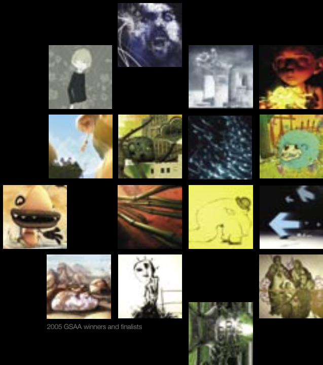
2005 GSAA winners and finalists